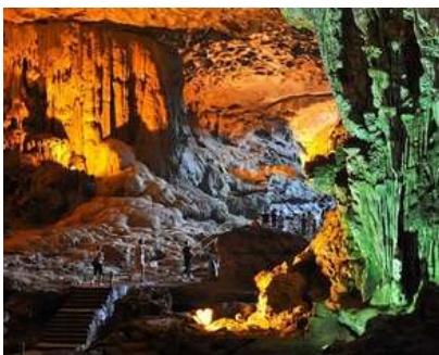
Thien Cung Cave

Meals : Breakfast/ Lunch on boat (Seafood)/ Dinner